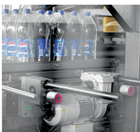
The bearing on the gear box is lubricated with two 60\,\mathrm{ml} simalube lubricators.