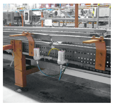
Two simalube lubricators with tube extensions lubricate a transfer chain in a brewery.