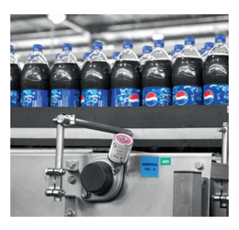
Lubrication of a flange bearing on a filling machine for soft drinks.