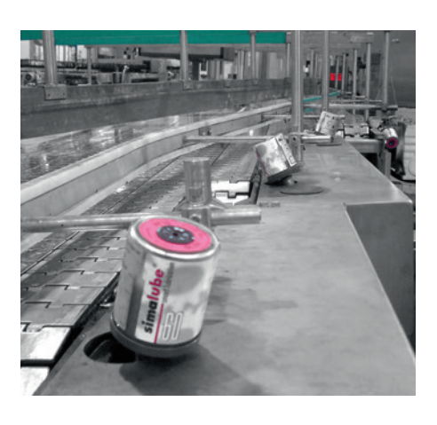
A filling line is equipped with several simulube lubricators.

«simalube lubricates continuously, extends the lifespan of the production machines and sinks maintenance costs»