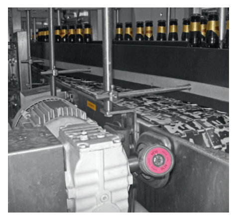
Lubrication of a transport belt with a simalube lubricator.