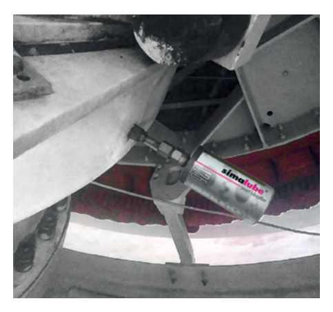
In this wind turbine, the simalube lubricator is set with a dispensing time of six months.