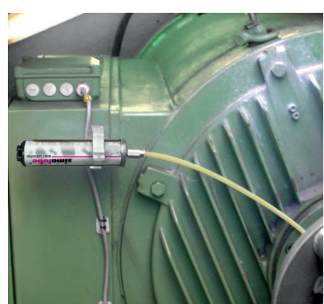
With the simalube 250 ml lubricator, the generator is continuously supplied with lubricant for up to 12 months.