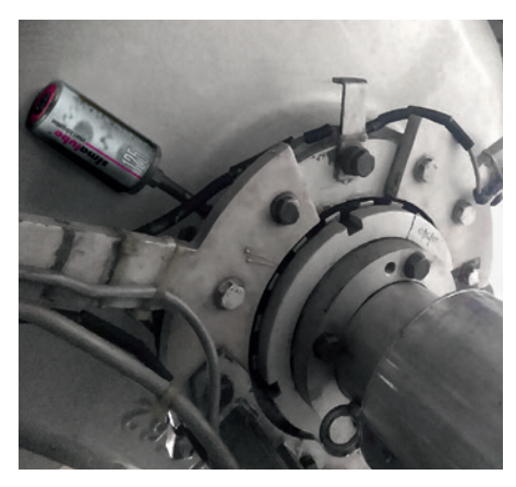
With the practical simulube accessories, it is possible to easily equip each lubrication point with a simulube dispenser.