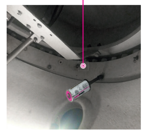
Automatic lubrication using the simalube 125 ml on a rotor blade bearing.