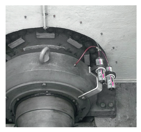
Two simalube 250\,\mathrm{ml} lubricators lubricate the main bearing of a wind turbine.