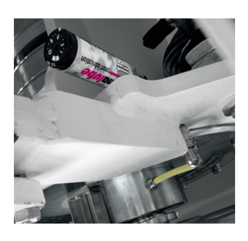
Even in tight spaces, the smallest lubricator lubricates reliably and precisely.