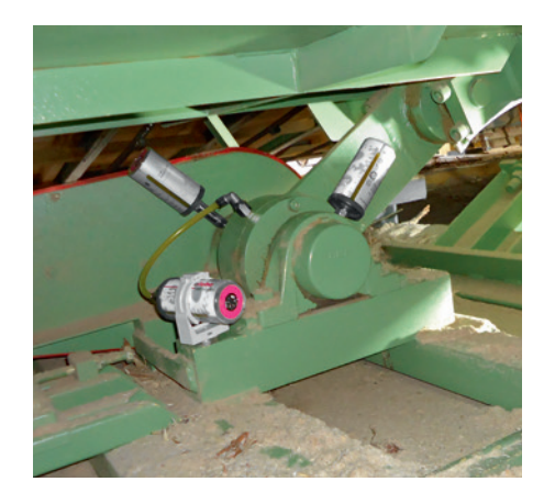
The bearings of a vibration channel are lubricated continuously by three lubricators.

«Considerable saving of time and improved safety in the workplace thanks to automatic lubrication»