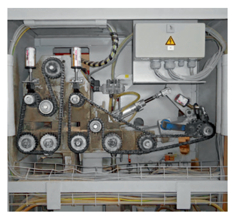
The chains of a cross-cut machine with roll feed are permanently lubricated using three simalube lubricators fitted with brushes and cleaned at the same time.