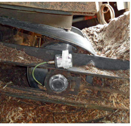
The Y-ball-bearing unit of a conveyor belt is continuously supplied with lubricant.

The spindle of a circular saw is reliably lubricated with two 125 ml simalube cartridges.