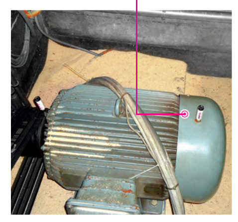
The electric motor of a chipping machine is lubricated in a sawmill.